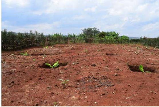
Gerards banana field with ACORN seedlings