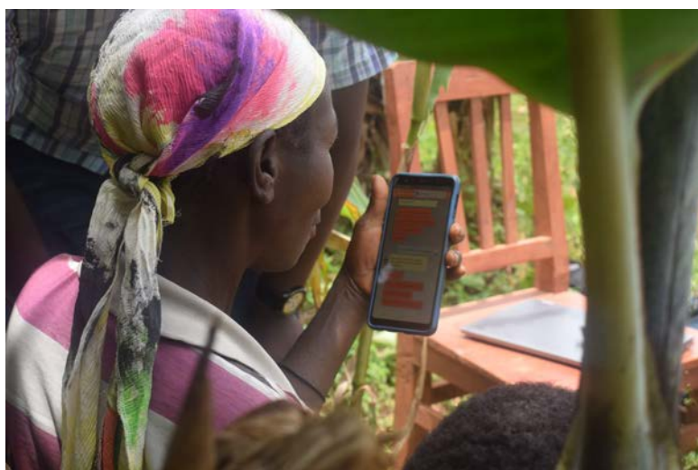
tested the new JEANNE app

It is nice to do it. It gives hope when the activities that we do are followed up.