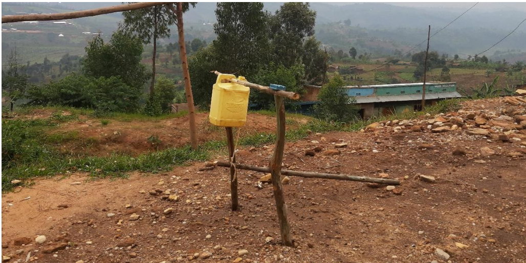
Picture outside the UMVA Centre of washing station. Saw some people using it when arriving.

Where do you get information from about Health?