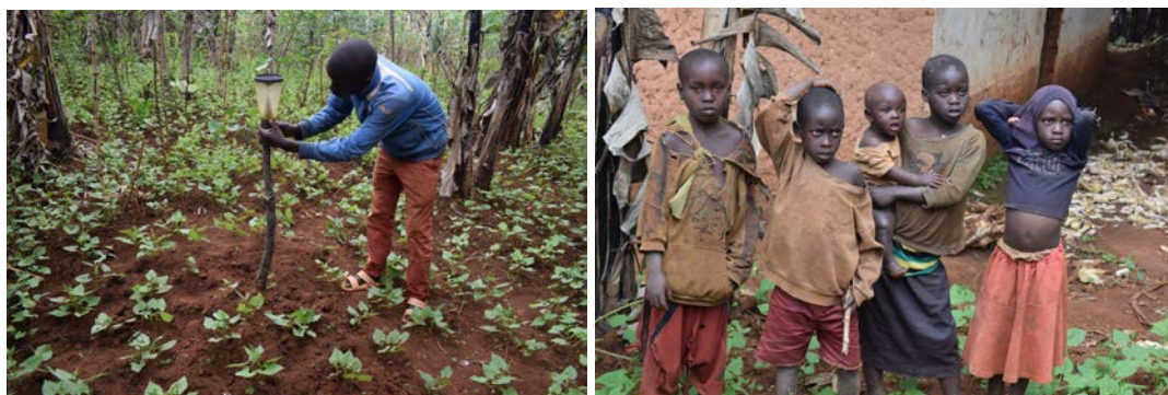
We visited the rain meter of Trésor, it was in between banana trees.